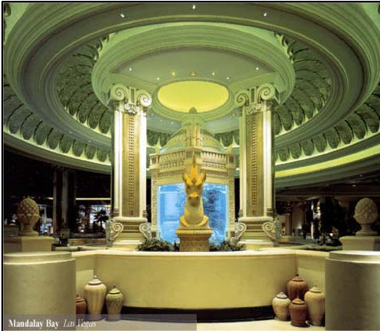
Mandalay Bay, Las Vegas